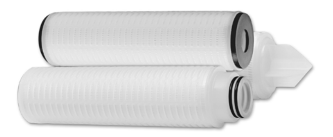
Figure 1: Xpleat PES Filters